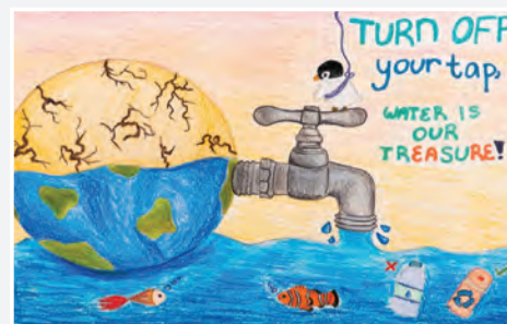
Haley Yoo Grade 5

Rolling Hills Country Day School Rolling Hills Estates, WBMWD Division I