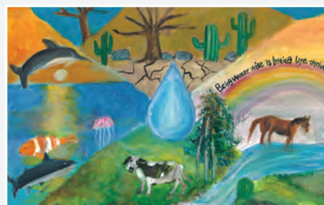
Abigail Lo Grade 3

Rolling Hills Country Day School Rolling Hills Estates, WBMWD Division I