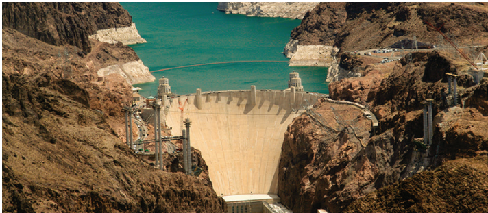
The Hoover Dam is part of the Colorado River system, located on the border of Nevada and Arizona.

Since West Basin began delivering wholesale imported water from the Colorado River in 1948, the District has provided a safe, secure, and cost-effective water supply to its service area.